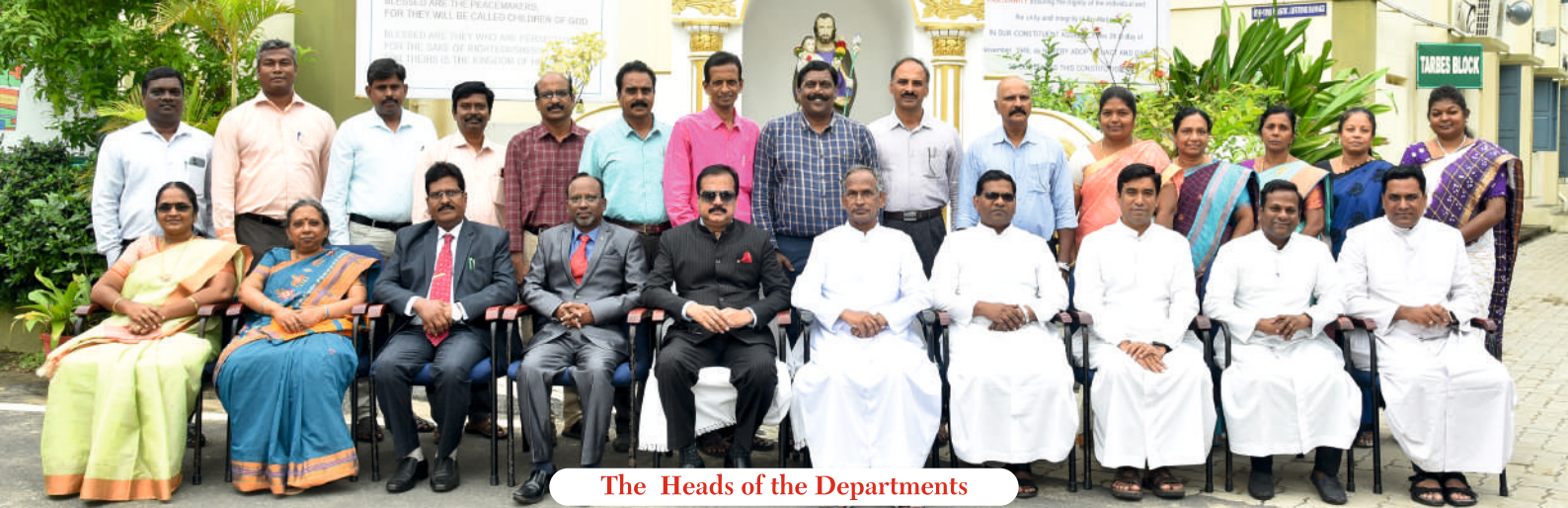
The Heads of the Departments