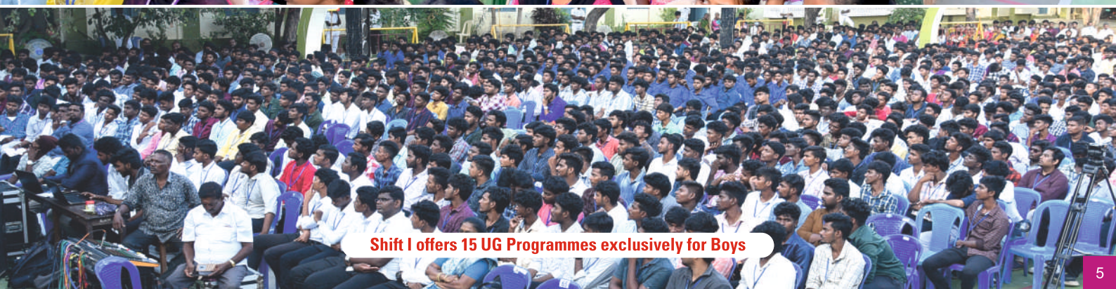
Shift I offers 15 UG Programmes exclusively for Boys