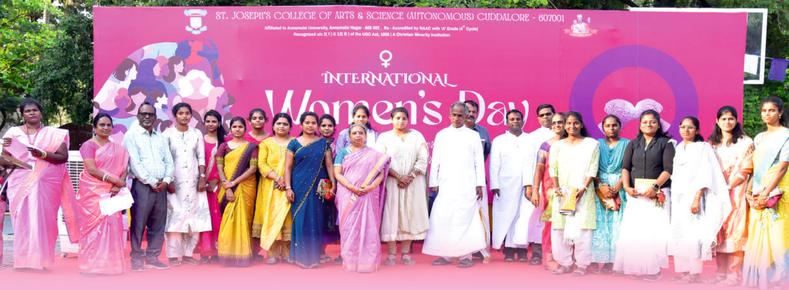
International Women's Day Celebration