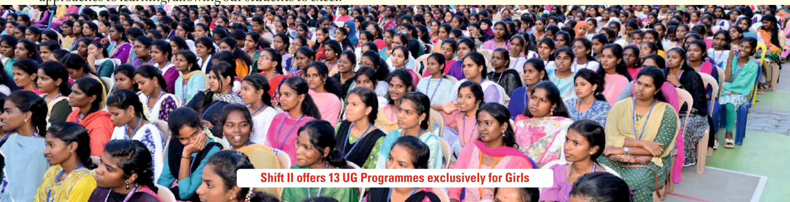
Shift II offers 13 UG Programmes exclusively for Girls

We insist on high standards of behavioural values to foster a sense of responsibility and self-discipline in our students. We instil the key values of human dignity, solidarity, peace and respect, which are constant themes of assemblies and our Spiritual, Moral, Social and Cultural development programmes.