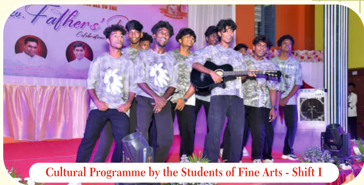
Cultural Programme by the Students of Fine Arts - Shift I