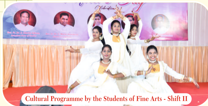
Cultural Programme by the Students of Fine Arts - Shift II