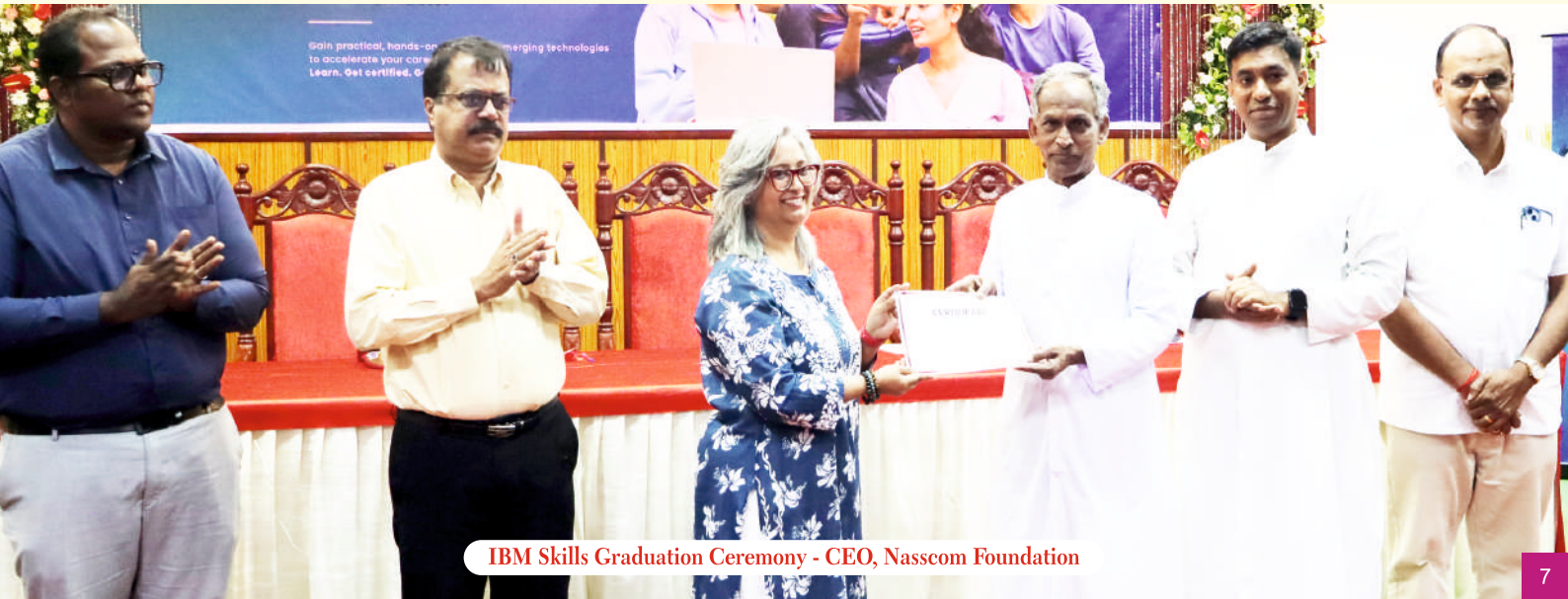
IBM Skills Graduation Ceremony - CEO, Nasscom Foundation

St. Joseph's has a reputation of being one of the best disciplined colleges in Tamil Nadu. While being an eminently 'learning place' to study in, our students observe the code of good conduct quite happily and readily. The Disciplinary Committee is empowered to deal with cases of indiscipline. The Secretary / Principal of the College is the ultimate authority to take action against any breach of discipline.