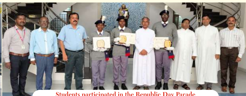
Students participated in the Republic Day Parade held at Chennai on 26.01.2026.